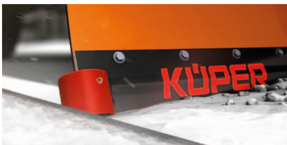
Küper curbstone deflector

A snow clearing blade accessory specifically developed for demanding requirements on the road. Durable, flexible and efficient.